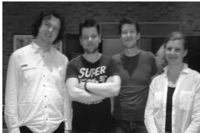
Pavel Haas Quartet