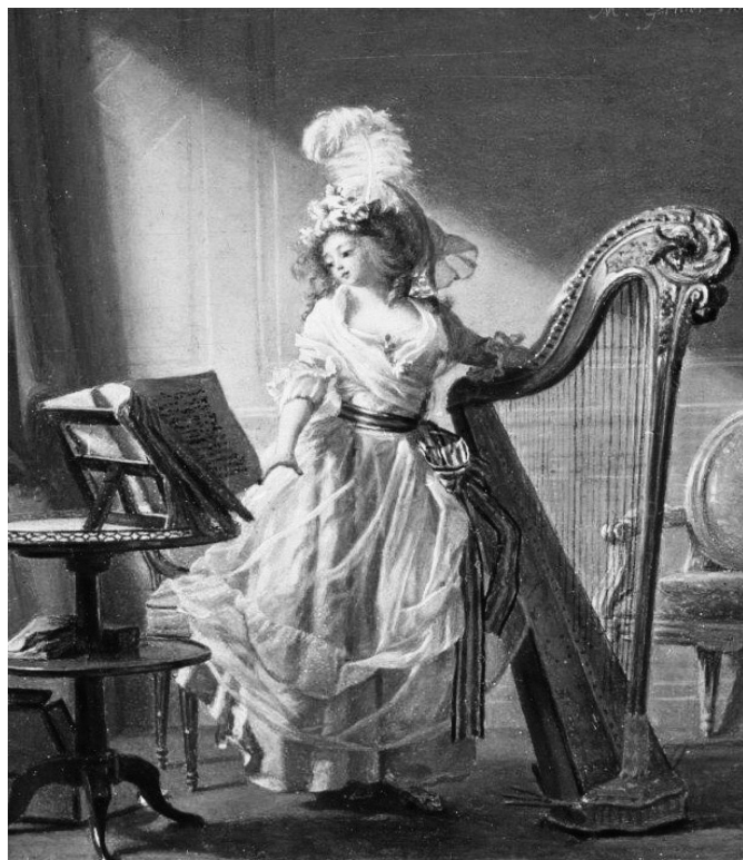
The Music Lesson by Michel Garnier, 1788

more notes. During this time, we begin to see hook harps, which are somewhat comparable to the Celtic lever harps of today. These hooks, operated by the left hand, were located at the top of the strings where they connect to the neck, and when engaged, they shortened the string, thus raising the pitch of the note by a semi-tone.