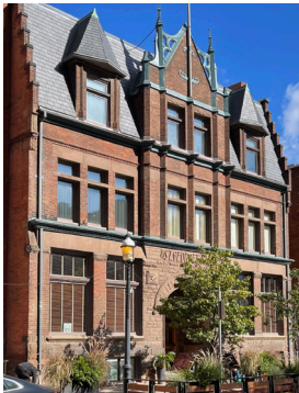
The Arts & Letters Club of Toronto

As president I welcomed all, and earnestly encouraged a quick march through the legally-required business – minutes of last year's virtual gathering, documentation