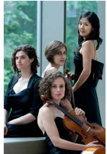
Cecilia String Quartet

The season concludes with one of Canada's most exciting young ensembles. The Cecilia String Quartet won First Prize at the 2010 Banff International String Quartet Competition (BISQC), the first Canadian group to do so since the St. Lawrence Quartet in 1992. The group is at present Graduate Resident String