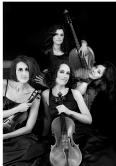
Cecilia String Quartet

One survey comment in particular praised the WMCT for "presenting a series that is one of the very best concert series in Toronto, Canada, and the United States." The Tuning Your Mind pre-concert lectures, refreshments at intermission, and a chance to meet and greet the artists are also features that were appreciated. Other perks are the semi-annual newsletter, the joy of sharing the concert experience with GTA high school students, and the annual master class. This year the master class will be led by the Cecilia String Quartet from 11 a.m. to 1 p.m.